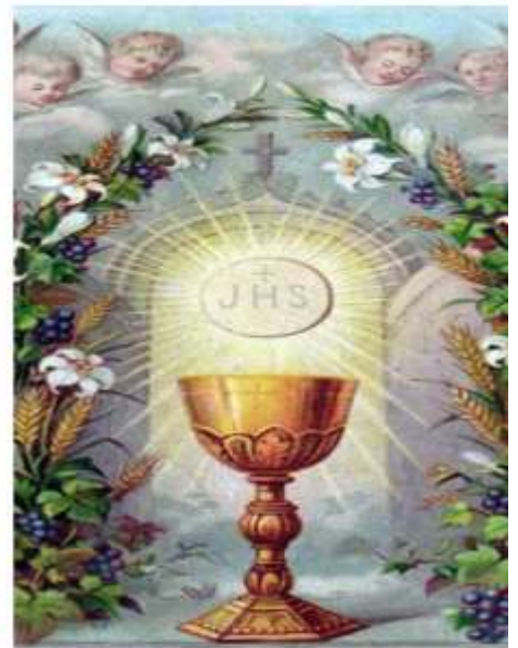
Corpus Christi June 19