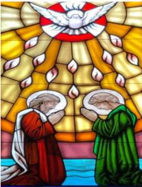
Pentecost June 5