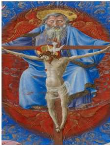
Holy Trinity June 12